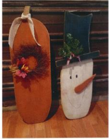
3 foot Wooden Figures

Fundraiser to benefit the Tunzi Family will be held at the Hampstead Fire Hall on Saturday, Nov 4 th . Door open at noon. Crafts begin at 1pm (three options). Dinner, guest speaker and silent auction from 5 to 6:30. Cash only Tickets Sales through Oct 20 th :