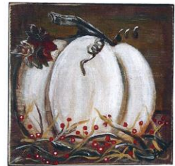
Large 12"x 12" Painted Canvas